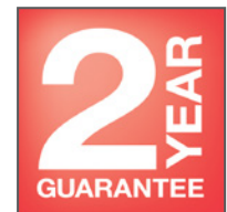
2 year warranty